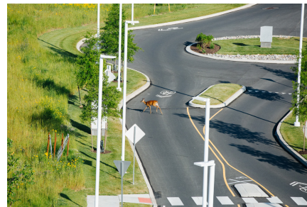
The campus attracts wildlife, including deer.