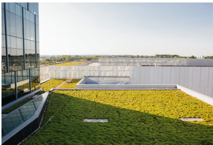
A green roof at the Air Products headquarters.