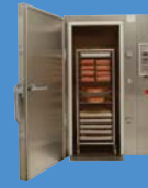
Air Products' Freshline™ Batch

The Air Products Freshline™ Batch unit uses the unique qualities of liquid nitrogen refrigeration for fast economic chilling or freezing of foods. The Freshline™ Batch has been specifically designed to meet the stringent needs of cook-chill and cook-freeze in the catering industry. It is also ideal for food processors with batch or low volume freezing/chilling requirements.